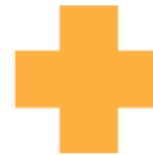
Physical & Mental Health