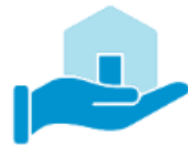
Safe and Stable Housing

*Step Up serves approximately 300 young adults aged 18 to 21 ongoing each month.